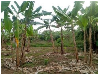
Photo: Babies Home banana plantation (0.5 acres). Our plantation was somehow affected by the long drought but we believe it will rejuvenate with the current rainfall.

Our plan is to grow beans, maize, Ground nuts, popcorns, and more vegetables in future when God provides us with funds and reliable rainfall.