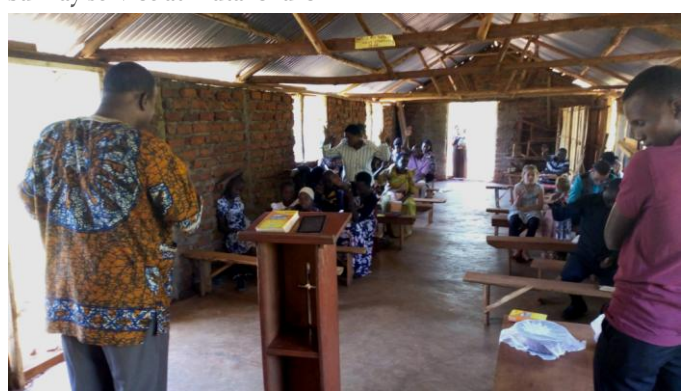
Sunday service at Mutai church