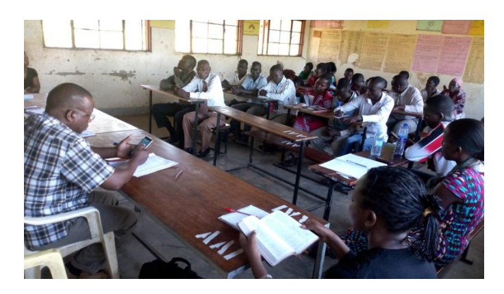
AAI Primary and nursery school staff meeting with the director

On addition to the Board meeting, several staff management meetings have beenheldat different venues of Arise Africa. These meetings have resulted into a number of changes for instance at the secondary school almost all the administrations staff were changed, we now have a new headmaster, academic deputy, and even new teachers, the changes are bringing new changes which are helping the schools to grow again. We need your prayers and financial help for the secondary school to recover and stand to achieve both academic excellence and moral excellence.